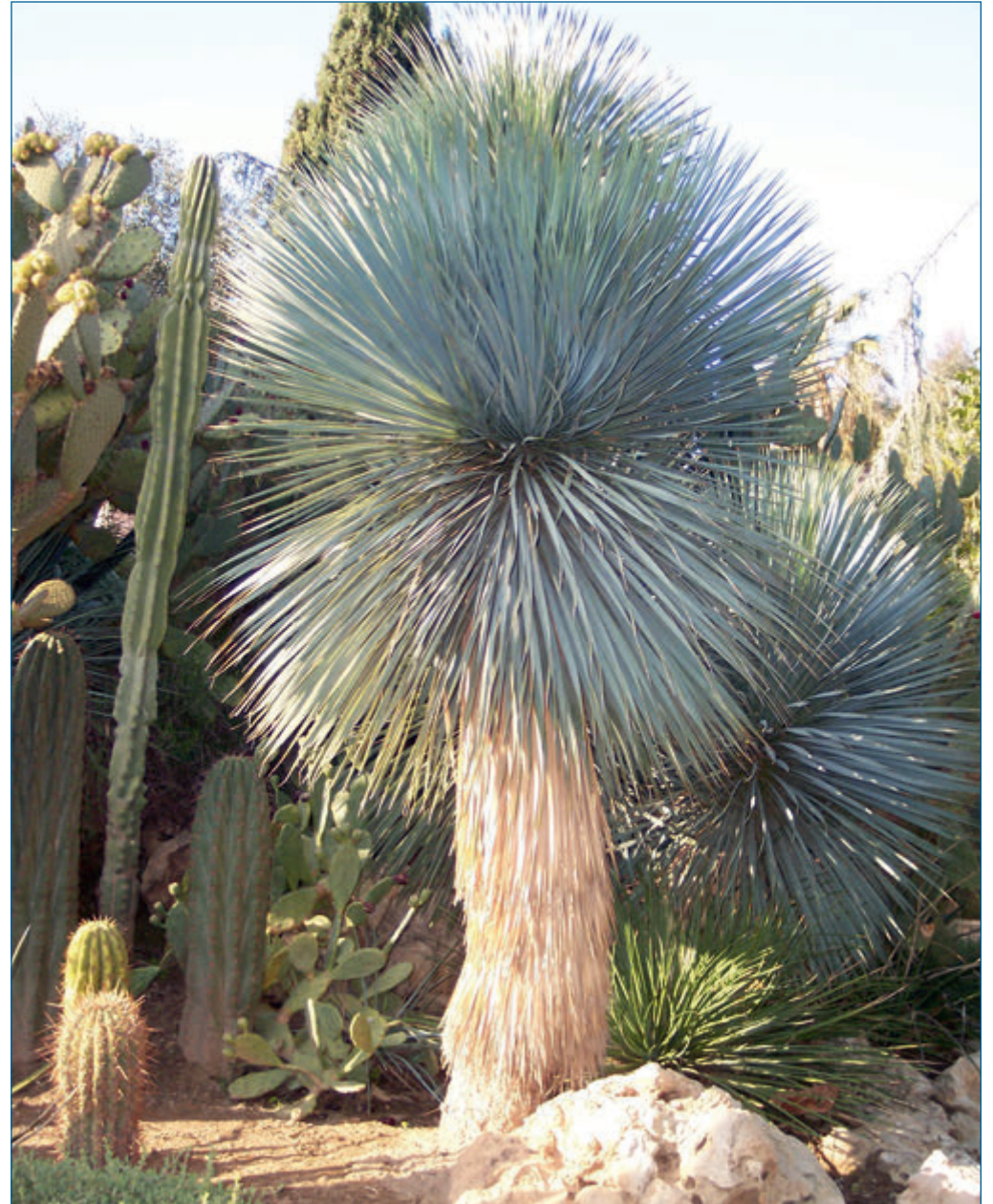
Beaked Yucca Yucca rostrata

This relationship is crucial as each needs the other to survive. Fruits bear a resemblance to a bird's beak hence the common name. Nearly all parts of the plant have practical uses from fibers from the leaves to soap from the roots. Highly prized as an ornamental, its native range is limited to the extremely arid regions of Brewster County, Texas and the northern Mexican states of Chihuahua and Coahuila. The population of this yucca is abundant in the wild thanks to effective conservation efforts.