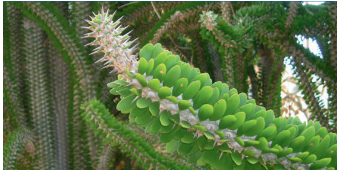
African Ocotillo Alluaudia procera