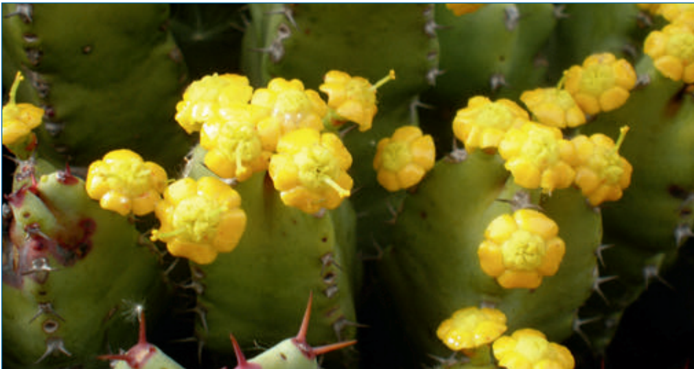
Moroccan Mound Euphorbia resinifera