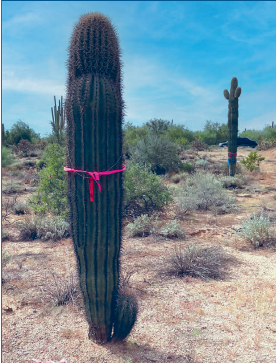
Giant Saguaro Carnegiea gigantea