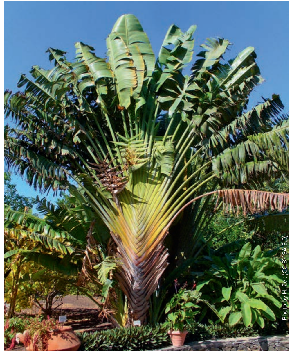
Traveler's Palm Ravenala madagascariensis

Traveler's palms are edible, for both humans and livestock, and it is also used in traditional medicine. Although its habitat is decreasing, the traveler's palm is not currently listed as threatened. This is good, because in some communities it is the most popular choice for building materials used in home construction and is harvested for flooring, walls, and roofing. This eases the pressure on other, more threatened, slower growing species.