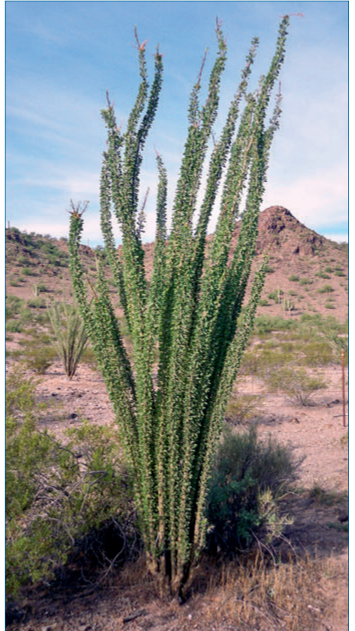
Ocotillo Fouquieria splendens