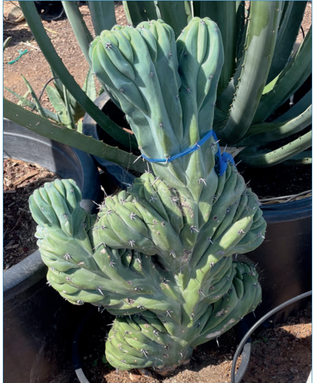
Blue Myrtle Cactus Myrtillocactus geometrizans f. cristatus

The fruits are very popular in its native region of central Mexico (from Tamaulipas to Oaxaca) where it is seasonally offered in markets as garambullos. The fruits also have medicinal qualities while the dried out stems have a variety of uses among the local people.