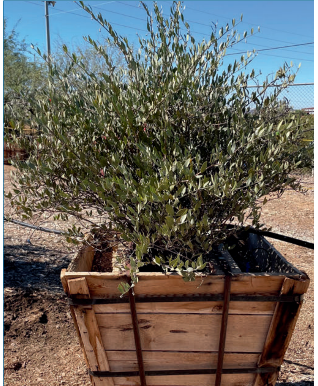
Jojoba Simmondsia chinensis