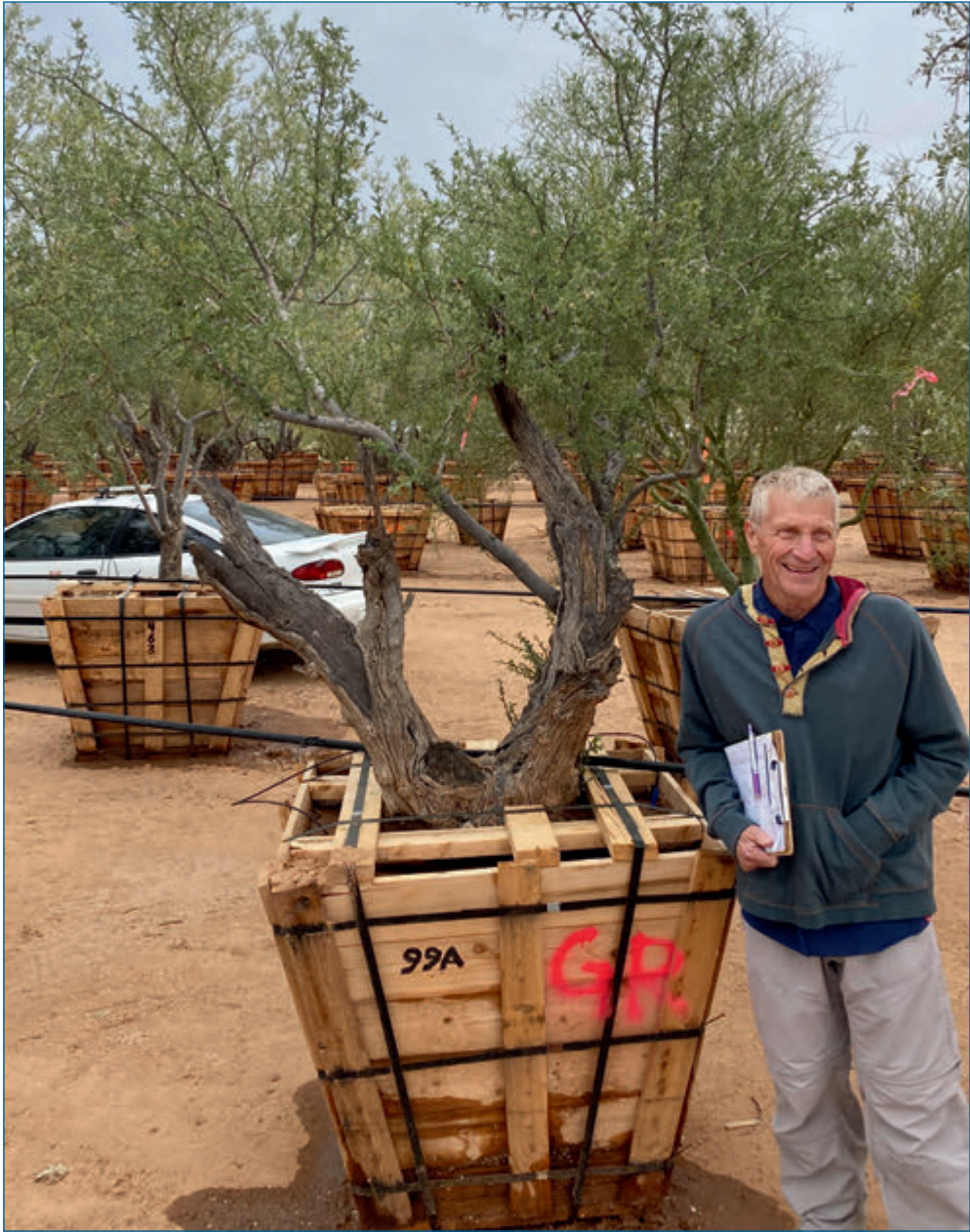
Ironwood Tree Olneya tesota