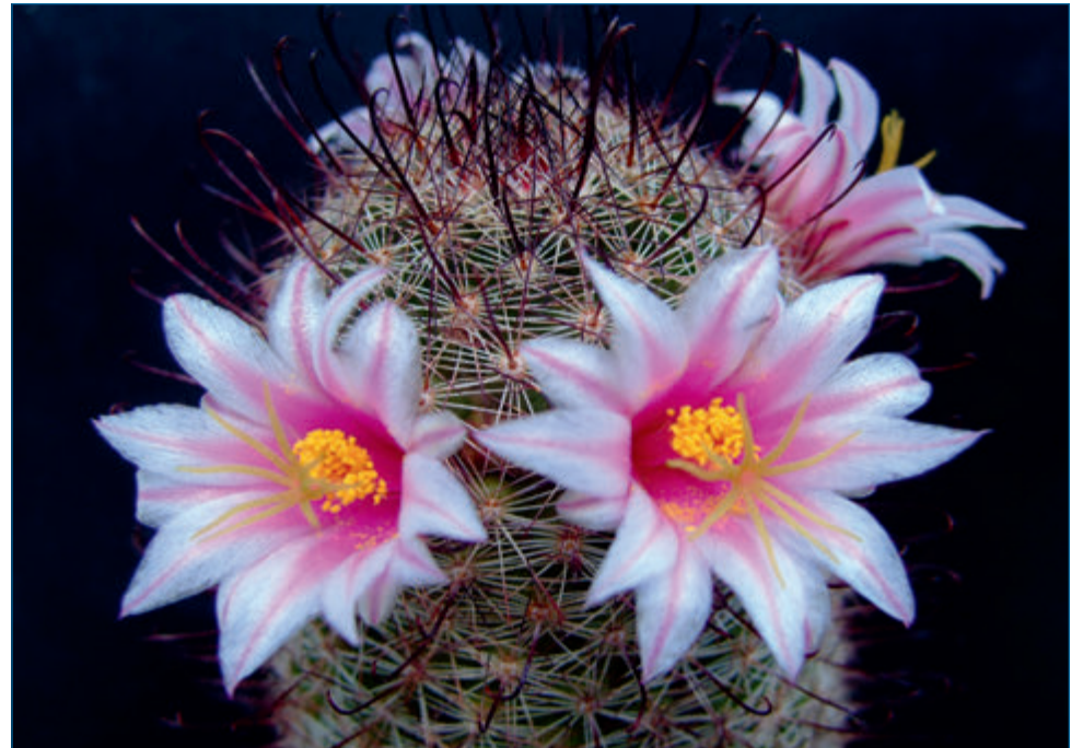
Pincushion Cactus Mammillaria species