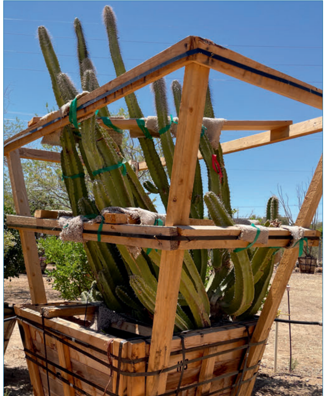
Senita - Old Man Cactus Lophocereus schottii

Senita has a highly specialized pollinator relationship with the senita moth. In exchange for pollination, the moth lives out its entire lifecycle solely on this cactus. This is a fine example of mutualism where the survival of each species is dependent upon the other. This is only the third known example of a profoundly strict pollination-related mutualism.