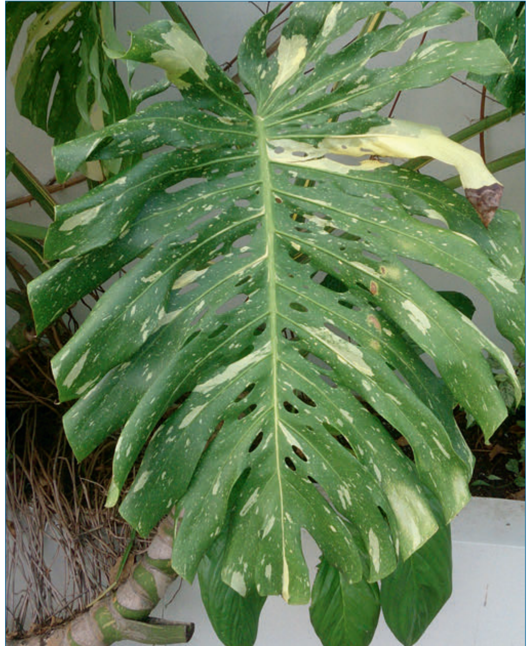
Variegated Monstera Monstera deliciosa 'Variegata'

They easily set the look of any tropical plant collection with striking coloration and distinctive exotic foliage. This look also makes it easy to see why this plant is so coveted, with collectors paying previously unheard-of prices for a houseplant. Variegated monstera plants are difficult to reproduce from seed, so cuttings, carefully tended by greenhouse technicians, are the only viable way to get new plants, hence the cost.