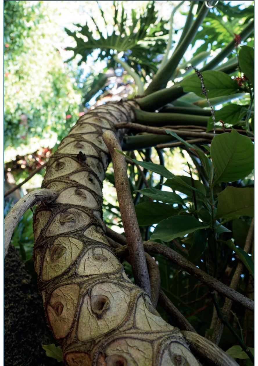
Tree Philodendron Thaumatococcus bipinnatifidum

Tree philodendrons are the epitome of lush tropical foliage. Their natural home is within the tropical regions of South America, and their large, deeply-lobed, glossy green leaves are the real showstoppers as they can grow up to 5 feet long in ideal growing conditions. With an overall height of 15 feet combined with those deeply lobed leaves, tree philodendrons are plants that command attention. Those lobed leaves are not just prized by plant collectors; as a unique adaptation they are thought to help the plant withstand wind damage, deter herbivory, and aid in camouflage. As the plant matures, it produces adventitious or support roots which superficially attach to nearby trees allowing the plant to climb through the canopy. As it climbs upward, strong aerial roots grow downward to keep the plant firmly in place. As a coveted ornamental plant, it has been given the Royal Horticultural Society's Award of Garden Merit.